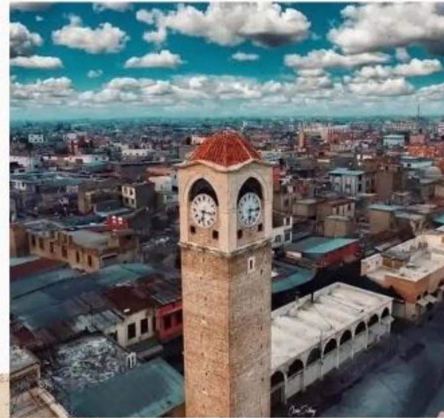
9 The Great Clock Tower (Büyük Saat),