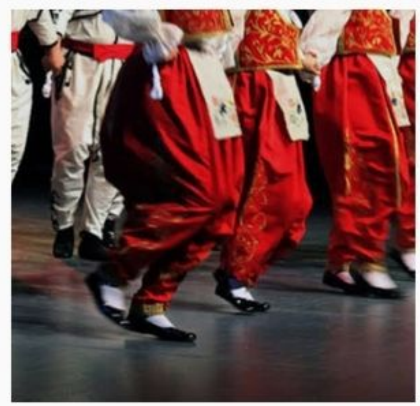
1 Learning traditional Turkish dances,

The first 6 days will take place in the picturesque Karadeniz Ereğli, followed by 6 unforgettable days in the culturally rich city of Adana.