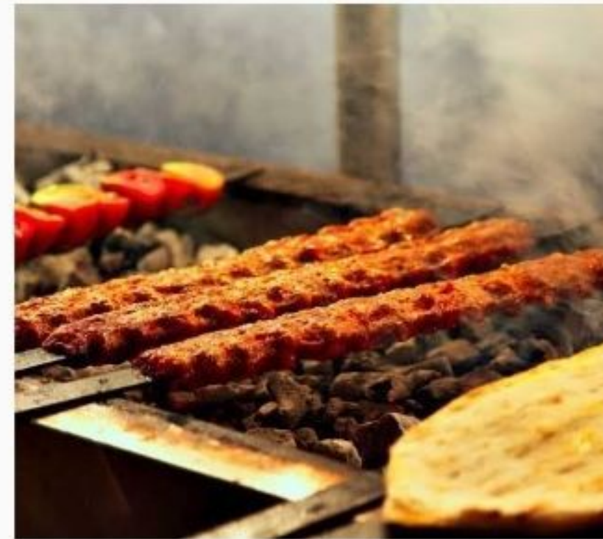
10 participating in an Adana Kebab Workshop to prepare our own kebabs,