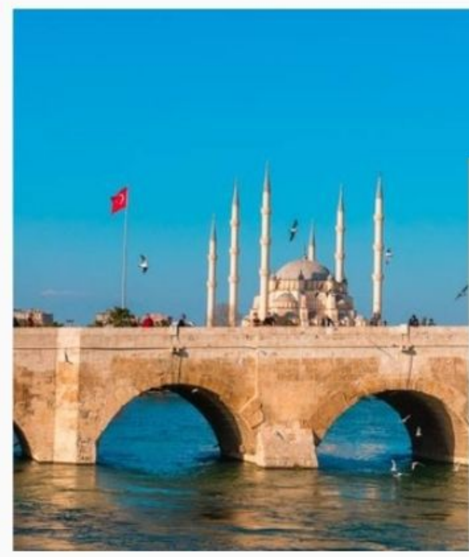
4 Stone Bridge (Taş Köprü)