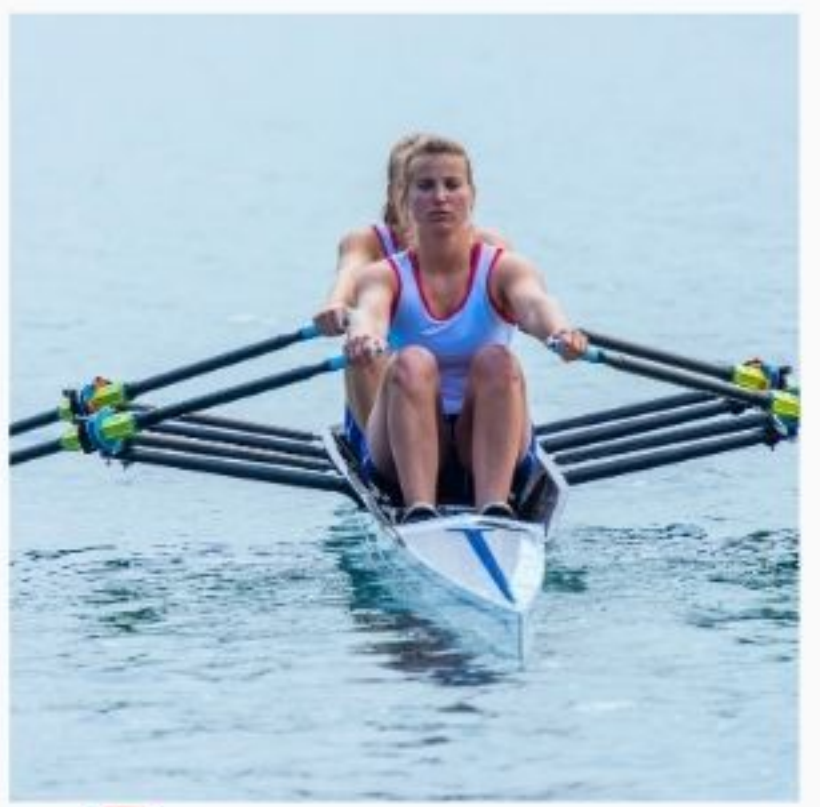
3 Rowing on the Seyhan Dam Lake,