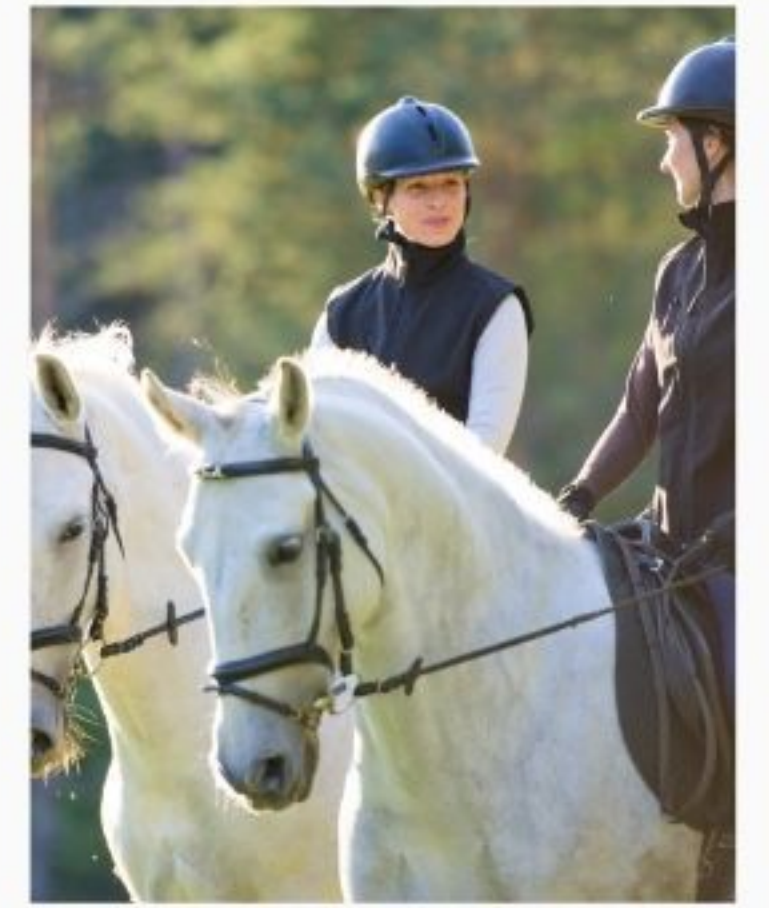
5 Enjoying the thrill of horseback riding,