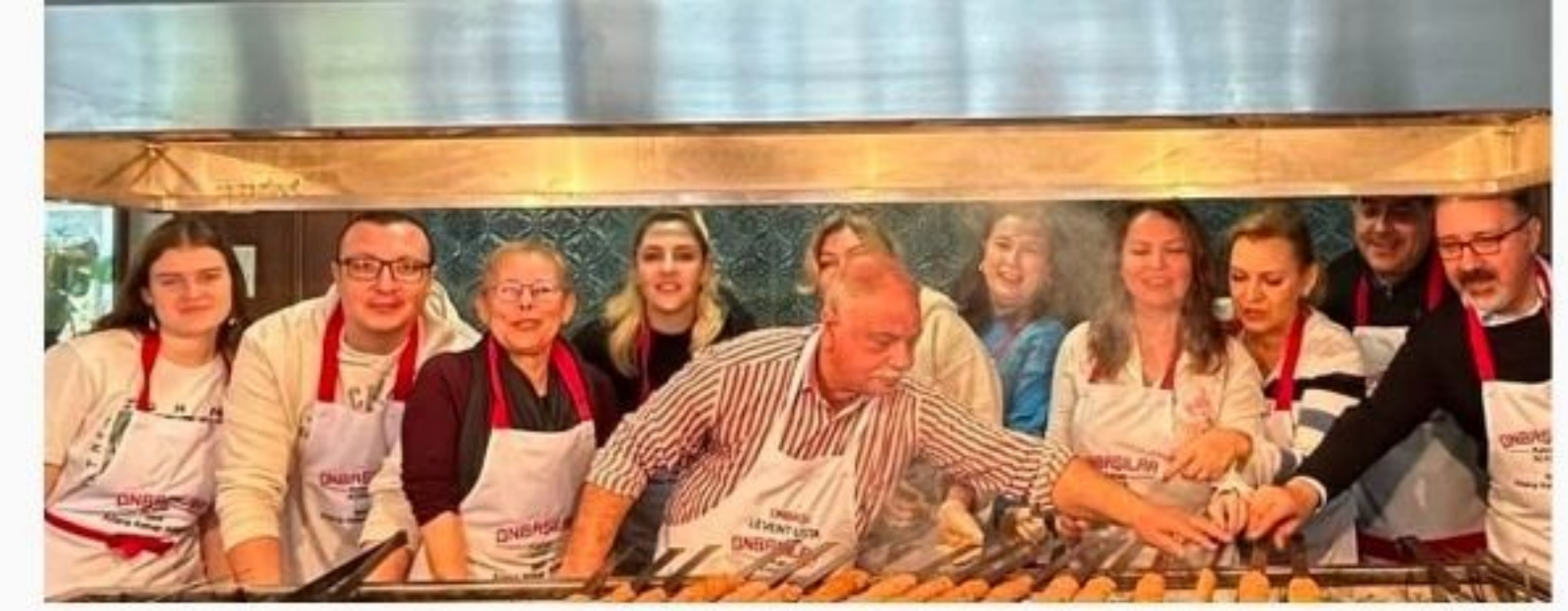
2 Savoring the world-renowned Adana kebab