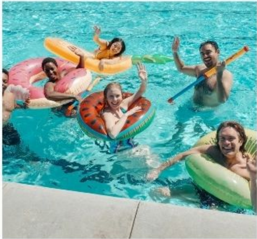
7 Swimming to fully enjoy the summer vibes!