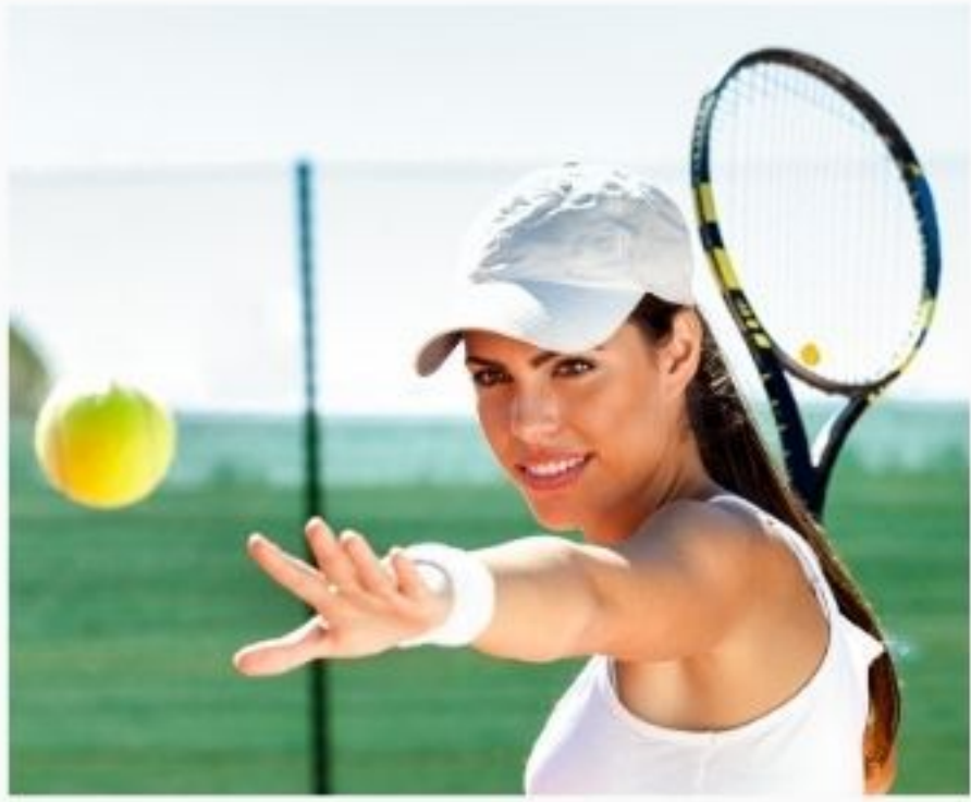
6 Playing tennis,