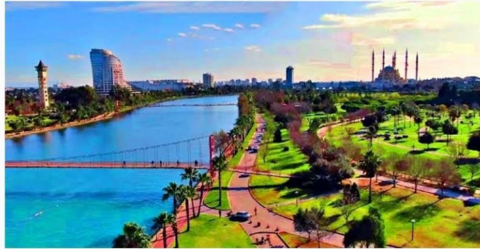
8 Exploring the historical places