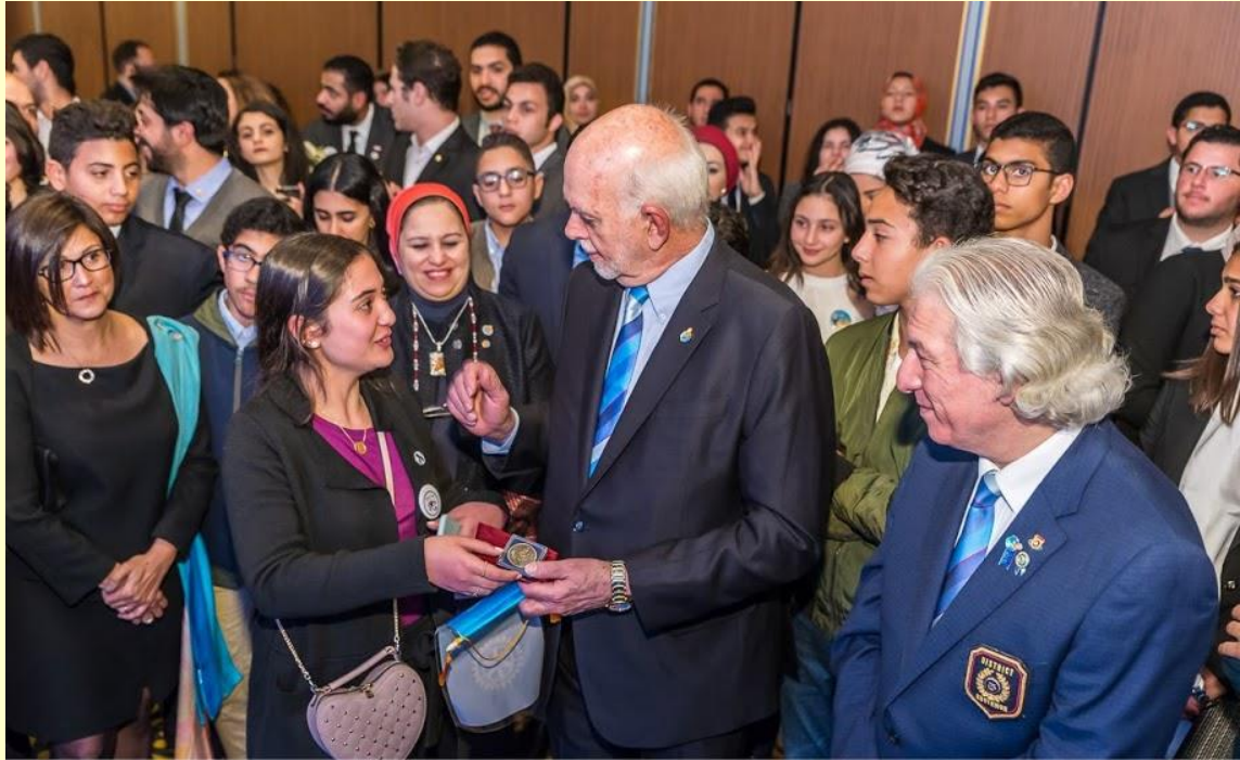
Rotary District 2451 Egypt RI President Visit to District 2451-Egypt 24-26 Feb 2019